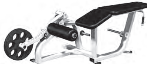
LEG CURL PRONE