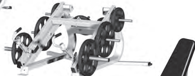
DEAD LIFT / SHRUG