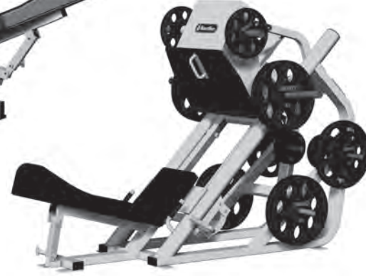
INCLINE LEG PRESS